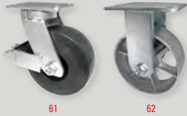
Swivel caster shown with optional face contact brake Part #61hu80li6525fy