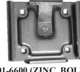
WCQCP-01-6600 (ZINC, BOLT-ON TYPE) WCQCP-01-6600-UNPLATED (WELD-ON)